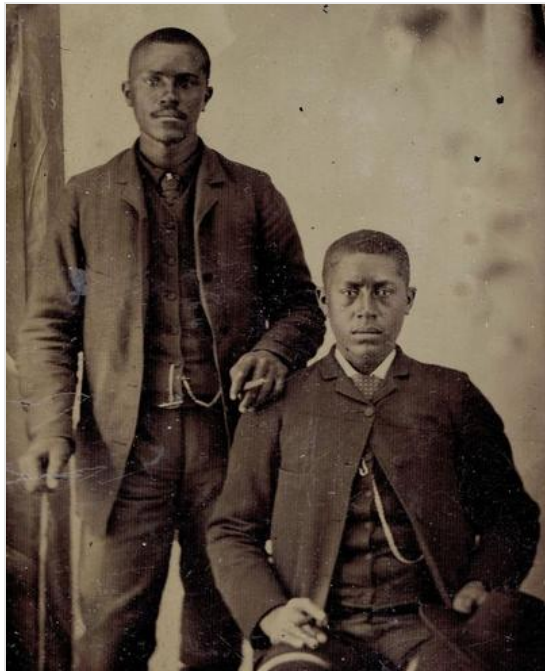
Visual Representation Of Cyrus